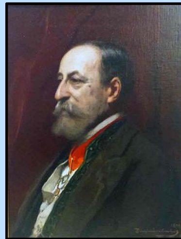
Camille Saint-Saens 1835 - 1921