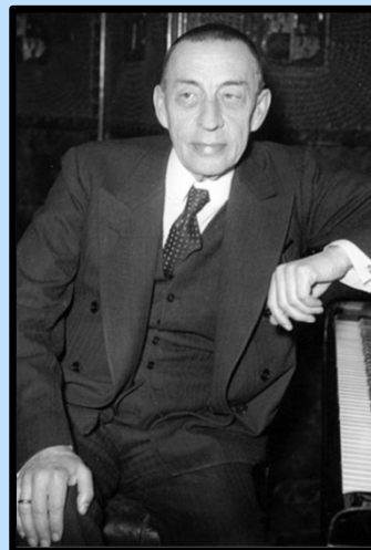
Sergei Rachmaninoff 1873 - 1943