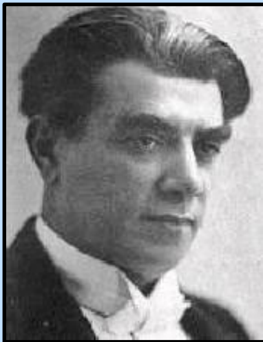
Reinhold Gliere 1875 -1956