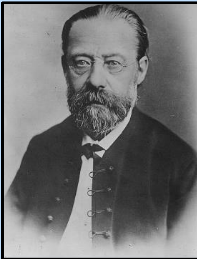
Bedřich Smetana 1824 - 1884