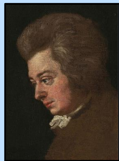
Wolfgang Amadeus Mozart 1756 - 1791